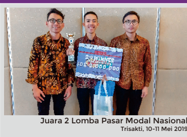
Juara 2 Lomba Pasar Modal Nasional Trisakti, 10-11 Mei 2019