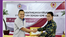
Kerjasama dengan KONI Kota Bogor, 30 Januari 2019