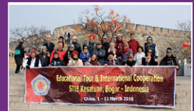
Educational Tour & International Cooperation China, 1-11 March 2018