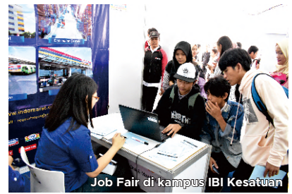
Job Fair di kampus IBI Kesatuan

IBI Kesatuan has prapered a Career Development Center (CDC) as a means to bridge and introduce graduates to yhe world of work, develop insight and knowledge, improve the quality of soft skills and cahnnel graduetes to companies collaborating with IBI Kesatuan