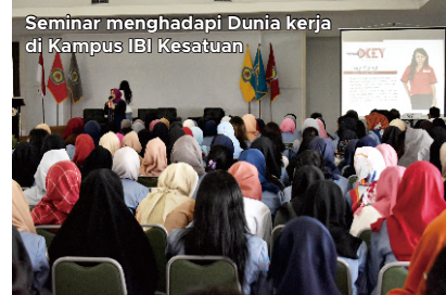
Seminar menghadapi Dunia kerja di Kampus IBI Kesatuan