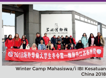
Winter Camp Mahasiswa/i IBI Kesatuan China 2018