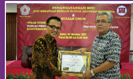
Kerjasama dengan Ikatan Akuntan Indonesia Bogor, 7 Oktober 2017