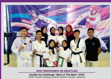
UKM TAEKWONDO IBI KESATUAN Kartika X2 Challenge "Best of The Best" 2019 GOR Tanah Abang District Sport Center Jakarta

PENUNJANG AKADEMIK : Pojok Bursa Efek Indonesia, Pojok Akuntansi, TAX Center , Kesatuan Entrepreneur , Career Development Center , Perpustakaan, CPA Test Center LABORATORIUM : Lab. Akuntansi, Lab. Pemasaran, Lab. Bank Mini, Lab. Bahasa Inggris, Lab. Bahasa Mandarin, Lab. Komputer SARANA PENDUKUNG : Musholla, Konseling, Unit Kesehatan Kampus ( Dokter Praktik ) Area parkir Indoor , Gedung Serbaguna, ATM, Wi-Fi SARANA OLAHRAGA : Lap Futsal, Lap. Basket, Lap. Badminton